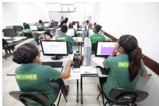
Social Enterprise Incores (Brazil).

Discussions with experts revealed different criteria or dimensions underlying the various perspectives for understanding and defining social enterprises. These criteria, illustrated below, which were shared by interviewees in Chile and Brazil, suggest that there are as many definitions as there are combinations of these factors, which can be slanted towards either end of the spectrum: