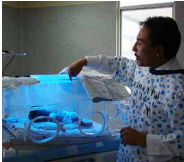
Social Enterprise Ingenimed (Peru).