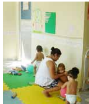
Social Enterprise União de Mulheres (Brazil).