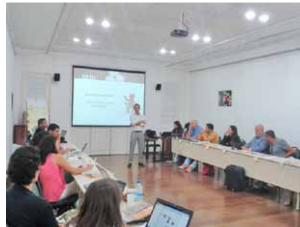
Planning Workshop in Finance and Risk Mitigation, 2013 NESsT Portfolio.

There is interest in conducting a sector by sector evaluation of the practices being carried out by social enterprises and studying other existing policies and areas of interest which could be expanded if social enterprises are given an opportunity to grow. Similarly, there is an interest in contrasting this information with the opportunities for social businesses in each country. The following experiences, listed by country, are noteworthy but do not represent the complete list.