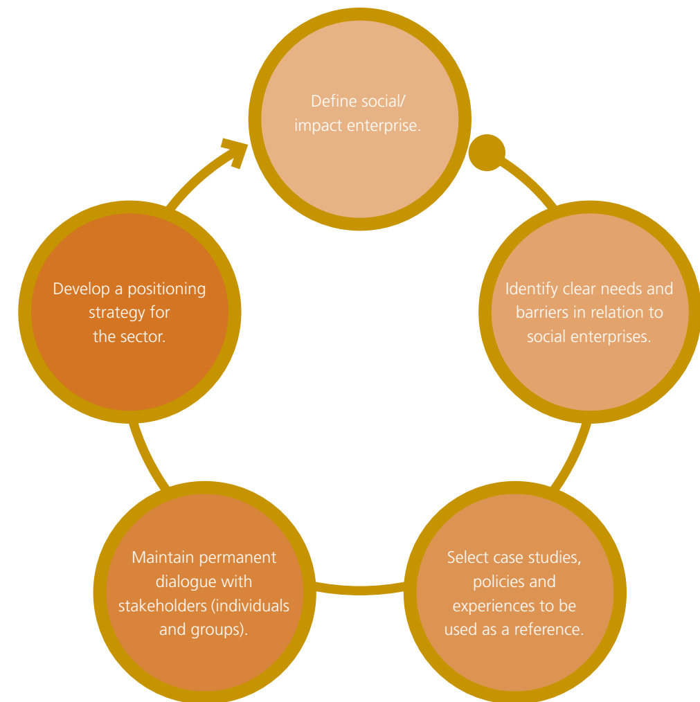
FIGURE 1 FRAMEWORK FOR POSITIONING SOCIAL ENTERPRISE ON THE PUBLIC AND POLICY AGENDA

Define the concept of social or impact enterprise: During the early stages of the sector’s development, it is important that definitions of the concept remain fluid. It is important to have a definition in order to start developing support policies; however, the general consensus is to avoid an overemphasis on the definition, as there is a risk of limiting discussions.