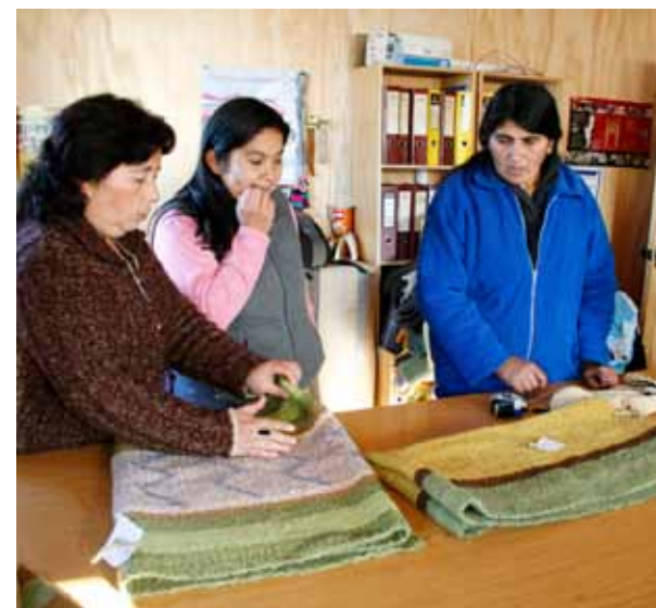
Social Enterprise, Relmu Witrál (Chile).

In order to facilitate country-level evaluations of the social enterprise sector, we propose the following model to organize and present the elements that are needed to advance the development of social enterprises: