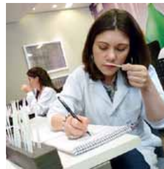
Social Enterprise Dorina Nowill Foundation (Brazil).