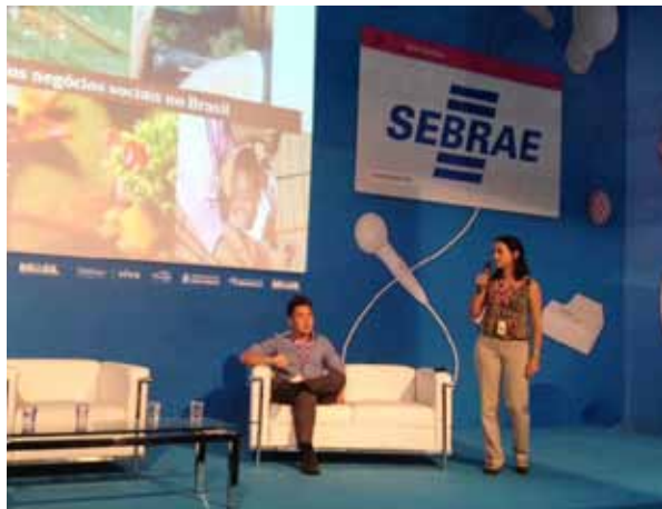
Panel on Social Enterprise organized by Sebrae National at Campus Party 2013 event.