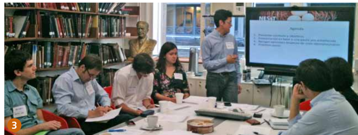
Workshops with sector leaders that were organized as part of this research. Photos 1 and 2, in Brasília, in the offices of the social enterprise Rede Pro Aprendiz. Photo 3, in the offices of the government agency Corfo.