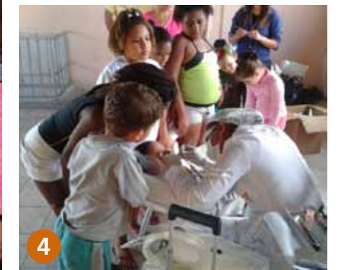
Social Enterprises: 1- Casa Panchita (Peru), 2- Coanil (Chile), 3- Magrini (Peru), 4- SOS Dental (Brazil), 5- Tëxsal (Ecuador).